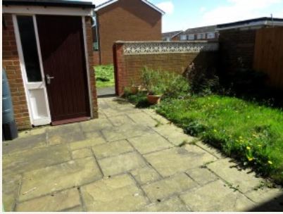
Garden To Rear