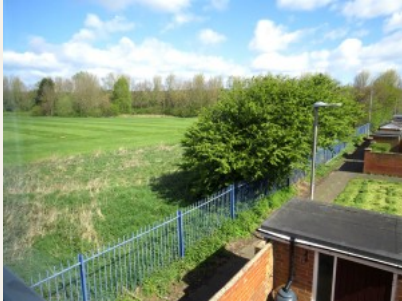
Open Outlook From Rear Bedrooms